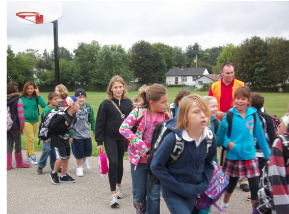
Students entering on the first day of school.

All parents are welcome to attend the meetings.