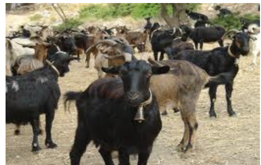
Our donations purchased 16 goats.